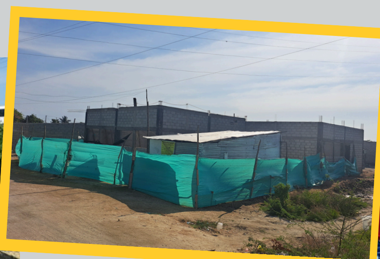
The church building in progress