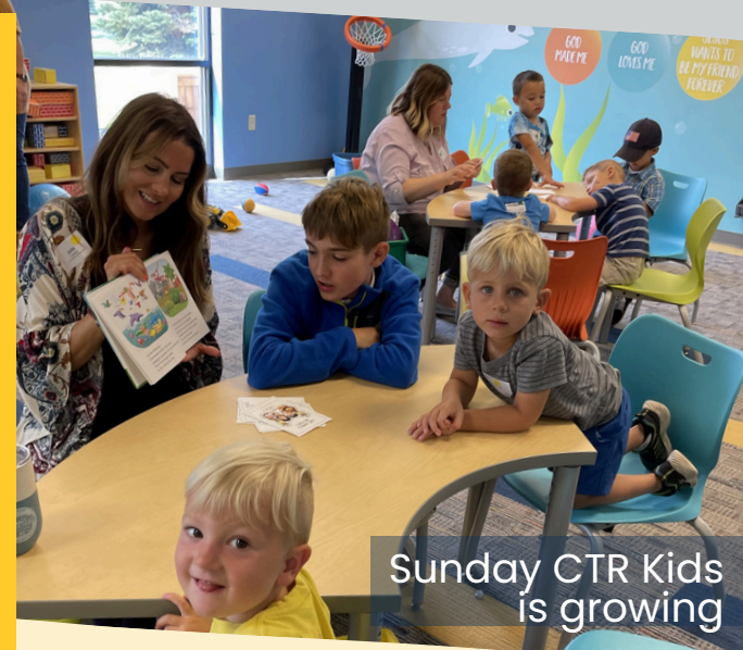
Sunday CTR Kids is growing