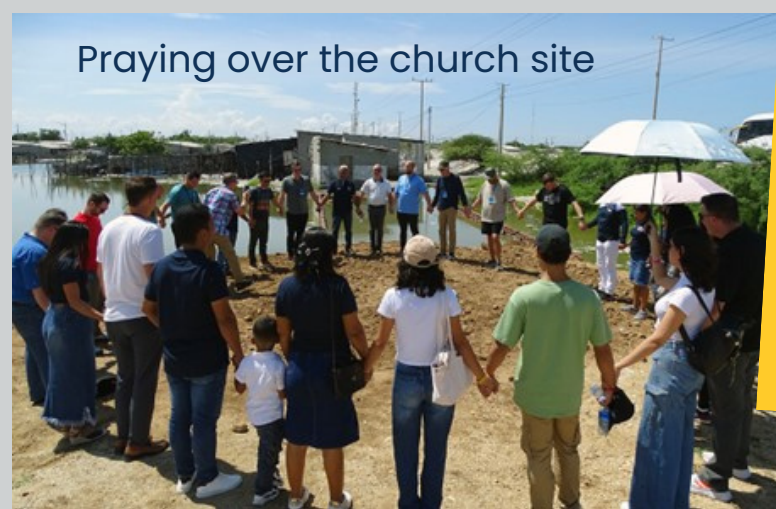
Praying over the church site

In 2024 God began forging a connection between CTR and a small fishing village