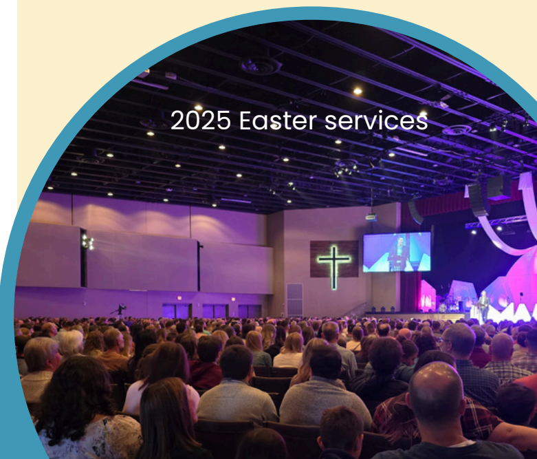
2025 Easter services