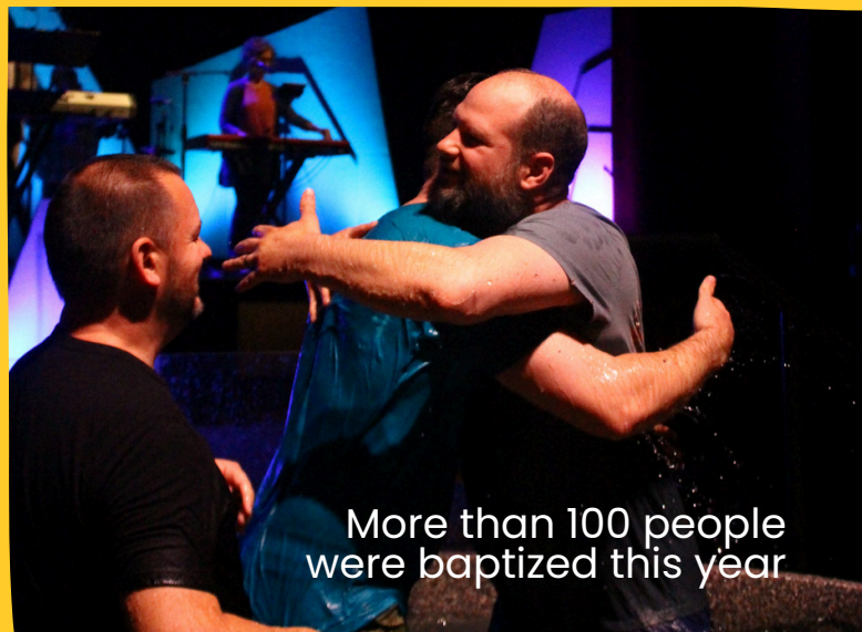
More than 100 people were baptized this year