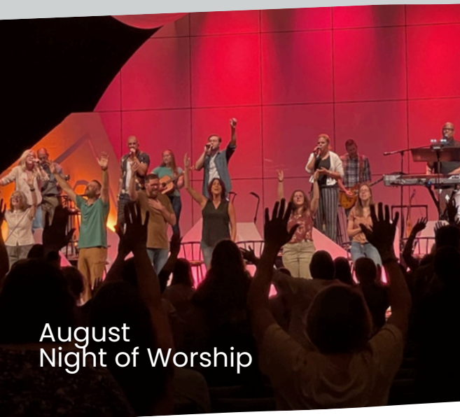
August Night of Worship