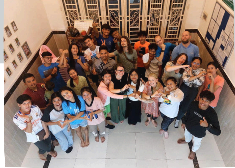
CTR team with students in Cambodia Peru medical team with supplies (below)