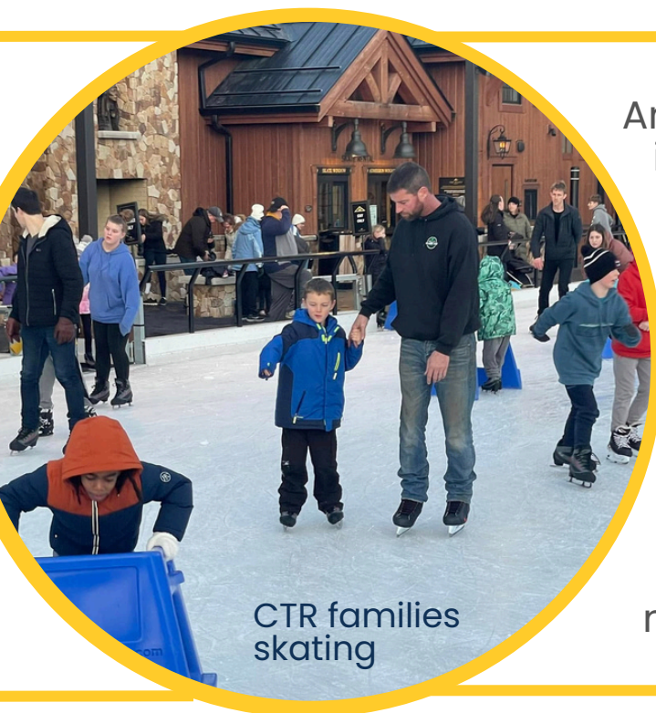
CTR families skating

Kids and students are engaging in amazing conversations and discipleship each week – thank you to our amazing volunteers!