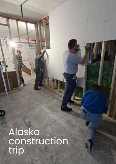
Alaska construction trip

Many of you donated toward these trips. Thank you for your generosity!