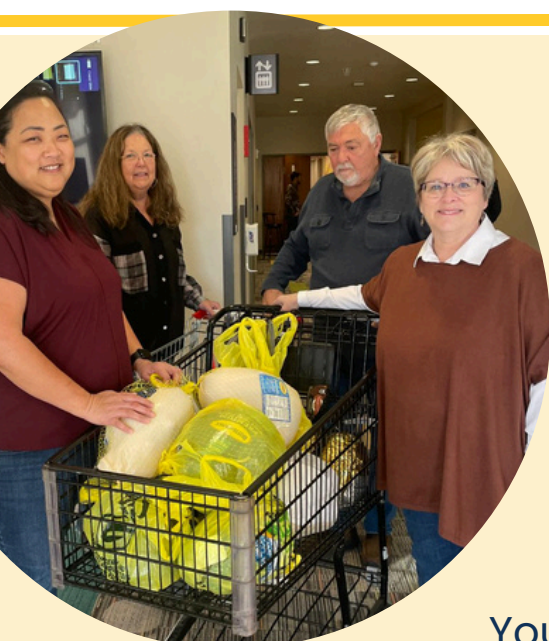
Some of our Food Pantry volunteers

This trip reminded me that His mission is alive in every nation, not just in our home church. I saw His love moving through people who have faced challenges far beyond anything I've known – yet their faith in the Lord was unshakeable. I don't see things the same way anymore. My prayers are bigger. My compassion runs deeper. I feel more called than ever to live with open hands and heart, ready to go, give and love wherever Jesus leads next.