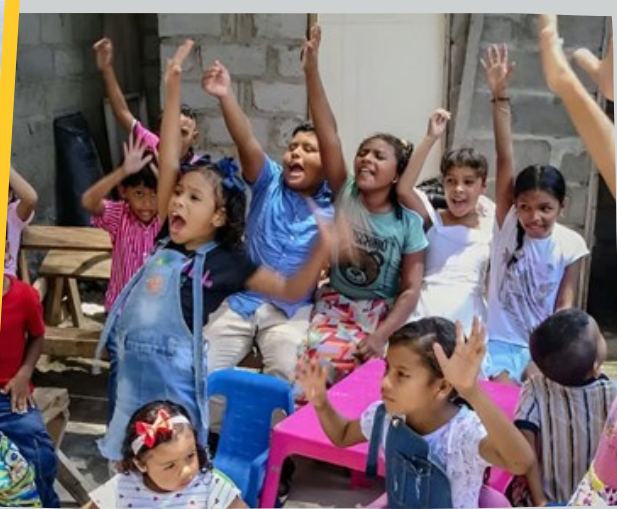
Tasajeras children's ministry